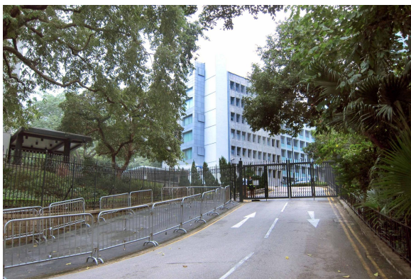
Entrance at Battery Path