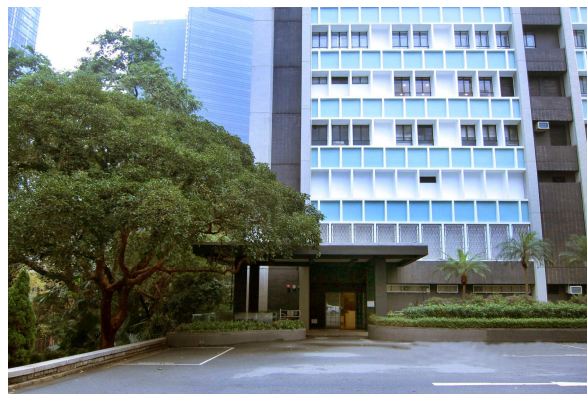
G/F entrance to the Hearing Room and Hearing Transmission Gallery (overflow room) in Main Wing, Central Government Offices