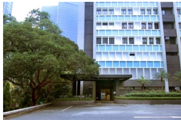
G/F entrance to the Hearing Room and Hearing Transmission Gallery (overflow room) in Main Wing, Central Government Offices