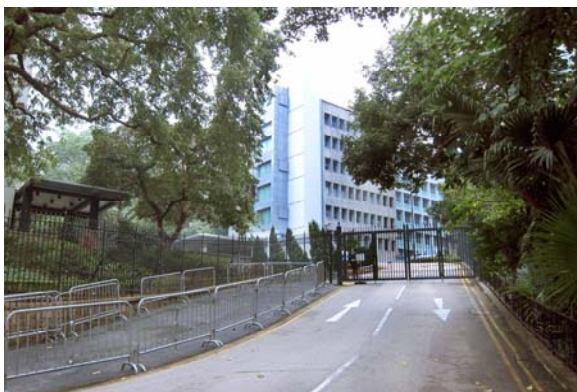
Entrance at Battery Path