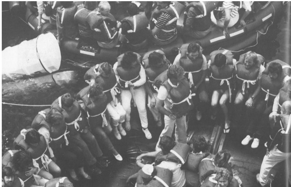
Photograph 2 of liferafts used during evacuation of “Our Lady Patricia”.