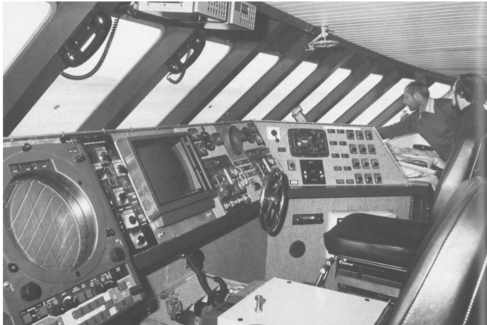
Photograph 3 showing the bridge of “Our Lady Patricia” which has 2 operating seats, 2 radar sets and 2 VHF sets.