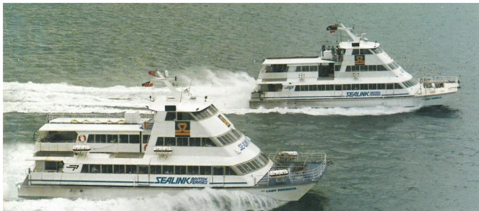
Photograph 1 of “Our Lady Patricia” and “Our Lady Pamela” which I introduced in 1986.

65. I believe that all vessels carrying more than 12 passengers should be required to carry liferafts sufficient to accommodate all persons on board if the voyage extends beyond Victoria Harbour. This is not just because of lifesaving in the event of collision or grounding but also in the event of fire. I realise that there is currently no such requirement in Hong Kong legislation 167 . Photograph 1 below shows two local high speed ferry vessels (which are very similar to “Sea Smooth”) I managed the introduction of in 1986 on the route from Portsmouth Harbour to Ryde Isle of Wight.