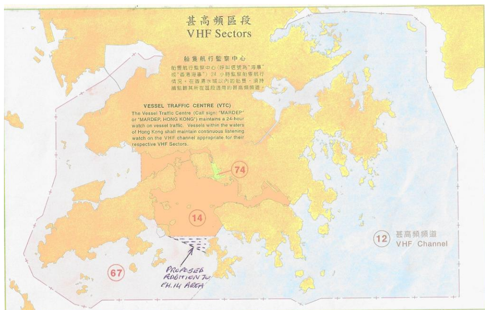
Diagram 1 showing suggested extension of VHF Channel 14.

slight adjustment to the VTS boundary between VHF coverage of Channel 67 and Channel 14, such that the ferry pier and the typhoon shelter are brought within the Channel 14 area. A simple illustration of such adjustment is shown in Diagram 1 below. This would avoid the need for vessels running into the Lamma Island berths to change channels at a crucial time.